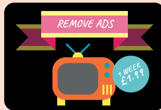
pay to stop advertisements